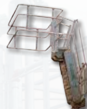
Gangway: 'Elite Series' Self-Leveling Stairs