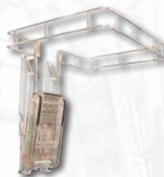
Gangway: Telescoping Ramp