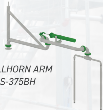
BULLHORN ARM TLBS-375BH